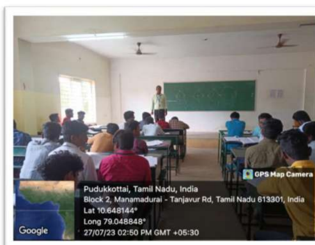
Sample Snapshots taken During the Course